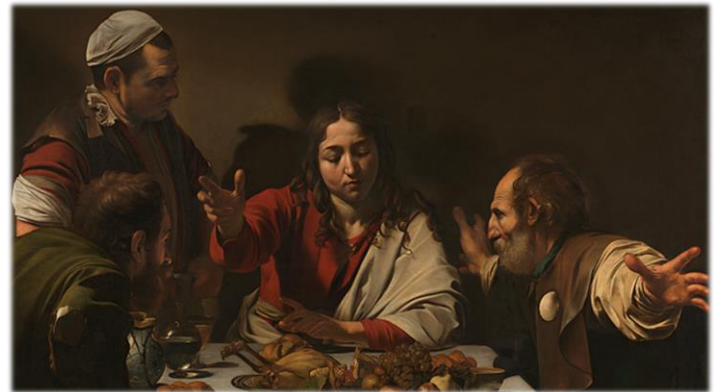
'Supper at Emmaus' Michelangelo Merisi da Caravaggio