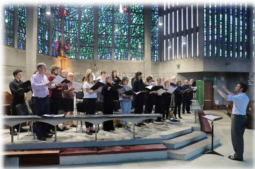
In rehearsal for a concert at the Church of the Good Shepherd, Nottingham

Although cathedral visits and tours, etc. are not covered by either of these arrangements, additional funding is available for such occasions.