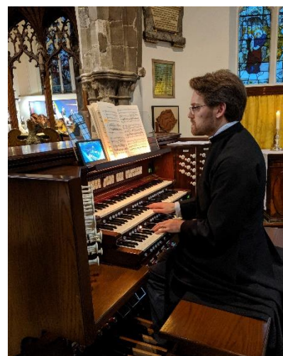
The Director of Music accompanying Durufle Requiem on Remembrance Sunday

Choristers are expected to be able to sing most weekends (term-time only for students), but it is recognised that volunteer singers may not be able to be present 100% of the time, and there is a simple online system for indicating planned absence.