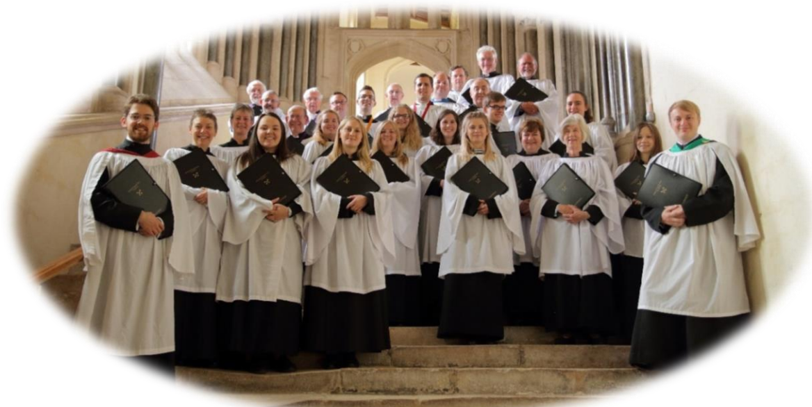
St Peter's Choir at Wells Cathedral