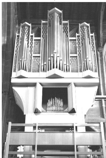
The Marcussen Organ at St Mary's Church, High Pavement (St Mary's is currently closed for major construction work on the church's floor)