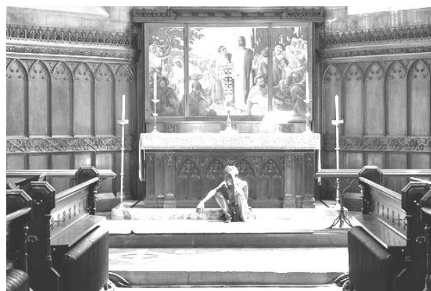
The sanctuary at All Saints' Church, Raleigh Street