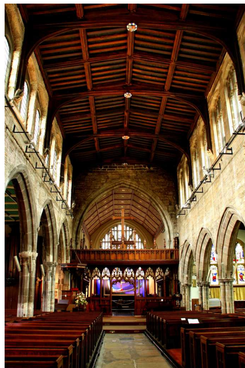
The nave of St Peter's Church