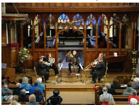
A 'coffee break' concert at St Peter's

There is no admission charge to morning concerts (though donations to the church music fund are welcomed), and as such, performers are not offered any fees, though many find the concerts an excellent way to start to build a public profile (the Nottingham Evening Post music critic often makes an appearance at the concerts).