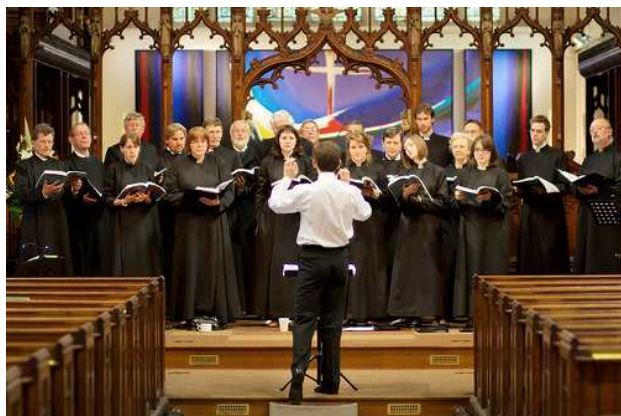
The church choir in rehearsal for a concert

If you would like to look around, the church is open Monday – Saturday, 10am – 4pm, and the Director of Music is always happy to discuss potential bookings.