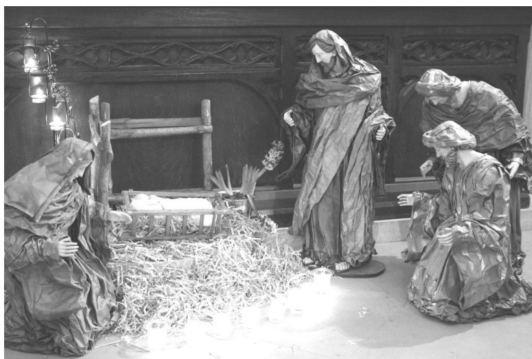
The Nativity Scene at the High Altar of St Peter's Church