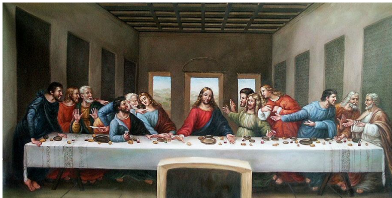
The Last Supper (1495–1498) - Leonardo da Vinci