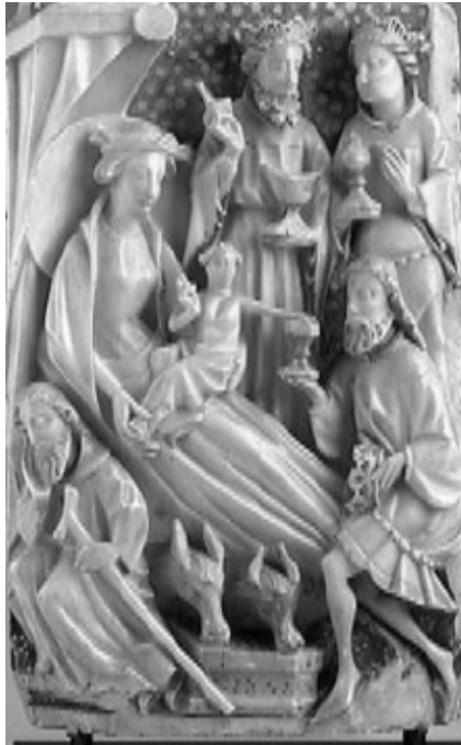
Adoration of the Magi - 15th century alabaster