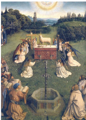
Adoration of the Lamb - Hubert van Eyck