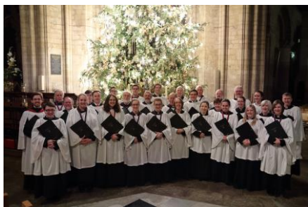
Ely Cathedral, January 2015

For me and the Choir of St Peter's, 2015 was a year shaped in particular by the continuing and developing tradition of choir visits. The year began with Choral Evensong at Ely Cathedral on Saturday 3 rd January. Though something of a challenge due to little rehearsal time and a difficult acoustic, our contribution to the cathedral's pattern of worship was met with positive feedback from both clergy and congregation, and it was lovely to have such a strong 'support team' with us from our own congregation. In May, the choir enjoyed a wonderful long weekend residency at the extraordinarily beautiful cathedral in Salisbury. The quality of singing during this inspiring trip was often some of the best I have experienced in my thirteen years at St Peter's, indeed it feels that (with the invaluable assistance of our excellent team of deputy choristers) a high quality of music is now all but guaranteed during these visits; variety is given instead, I think, by the singers' collective experience of different places and their associated buildings, acoustics, organ, liturgy, traditions, history, etc., and each member of the choir will have their own favourite destinations. The 'top spot' of my own list was replaced during the choir's October visit to St George's Chapel, Windsor Castle, which was a memorable occasion indeed (not least because as I conducted the choir, one foot rested on the grave of Henry VIII!).